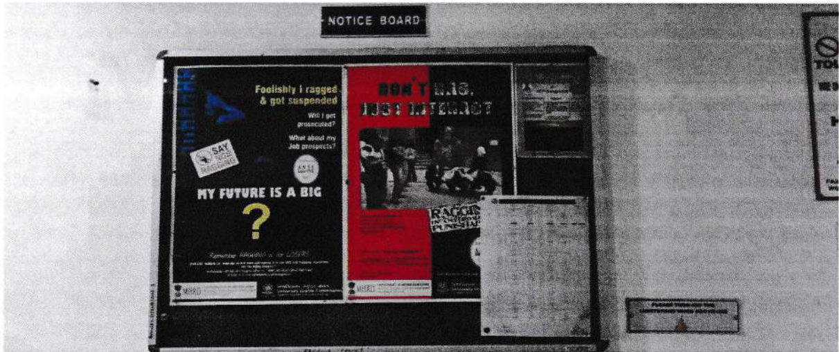
Display of Posters on Anti-Ragging

Throughout the Anti-Ragging Week, the campus was adorned with a series of thought-provoking anti-ragging posters. These posters were strategically placed in high-visibility areas within the college premises to ensure maximum visibility and impact. The visually appealing designs and concise messages reinforced the importance of creating a safe and respectful environment for all students.